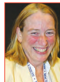
By Heather Kelley, Grand Lodge Representative, Educator

Preparedness plan, recruitment policy, training, readiness forms and lists, database, helpline, activation and deployment plan and process.