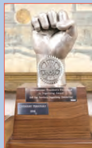
The main award, "IAM Top Territory Organizing Distinction" sits proudly at the Canadian office, just in front of the first charter issued for a local in Canada - LL103 in Stratford.