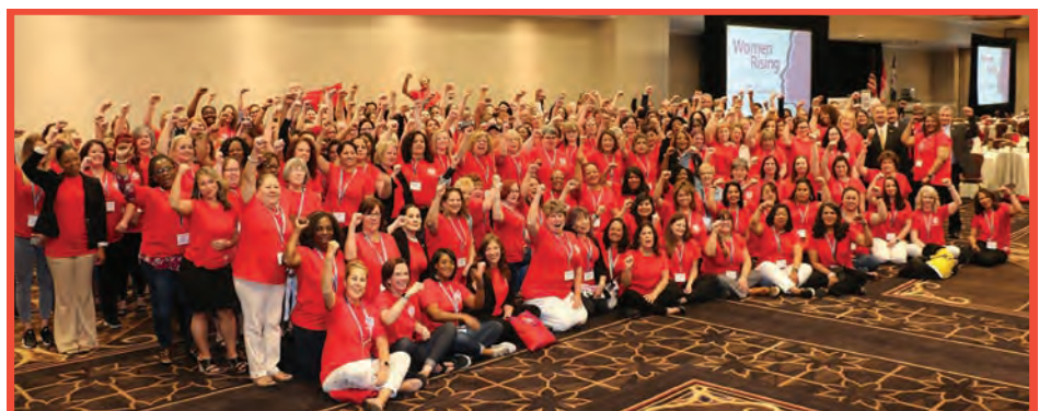
Delegates at the IAM Women's Conference April 2019, Las Vegas, NV